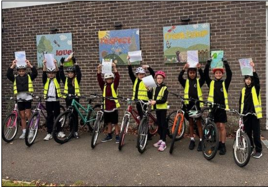
Figure 5 - St Mary's Junior School Ware, Year 6 pupils - Bikeability pupils with EH LCWIP posters