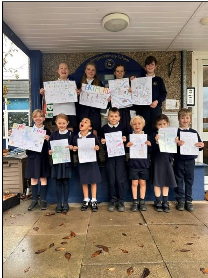
Figure 4 - Bengoe Primary School, Year 2 and Year 6 pupils – EH LCWIP posters designed during Cycle to School Week

During Cycle to School Week, several schools chose to engage with LCWIP materials, with Bengoe Primary School providing a particularly strong example. Pupils integrated LCWIP themed poster activities into the week's events, helping connect national active travel campaigns with local walking and cycling proposals.