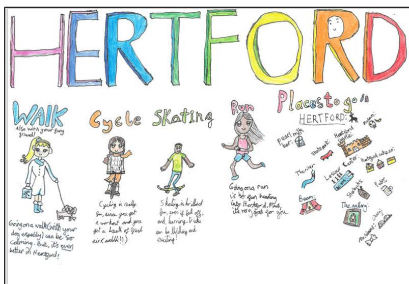
Figure 3 - Poster by Evelyn and Ava, Bengoe Primary School (Hertford)